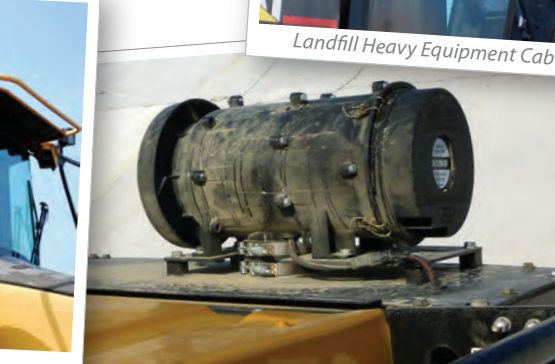
Heavy Equipment Cab